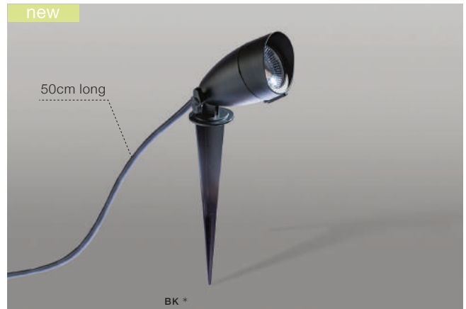
FLOKI 3000K / 4000K